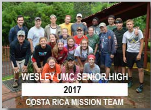
WESLEY UMC SENIOR HIGH 2017 COSTA RICA MISSION TEAM

“I feel like now not only am I a stronger leader, but a leader of leaders as I was able to help others on their leadership journey.”